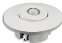
DALI-2 Master PIR built-in presence sensor, white, 115512