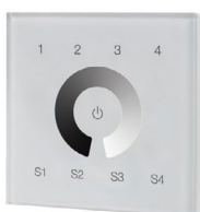
DALI 4 groups / 4 scenes Recessed touch master dimmer, white 115061