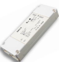
DALI-2 Interface Bluetooth 5.0 master-controller incl. app 115014