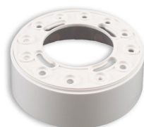
Surface-mounted housing for art. 115512 DALI-2 Master PIR presence sensor 115518